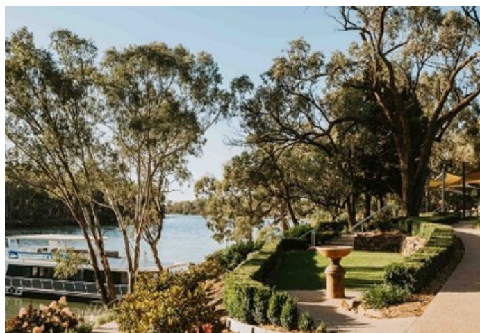
Don't forget the wineries while you're there!

While Melbourne will be dark and freezing in June, staying up north will mean you'll be enjoying lovely and sunny weather with cool (but not freezing) nights.