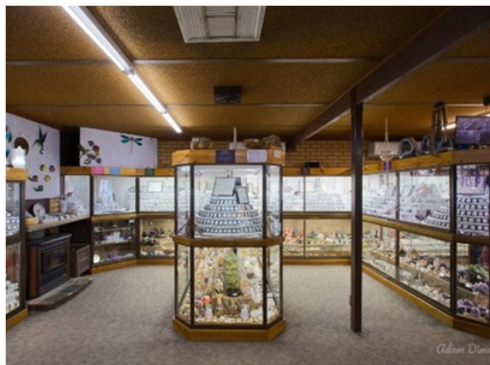
Woodsies Gem Shop, which the family will enjoy!

Don't forget to book any accommodation you might need well in advance.