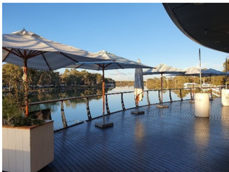
The Boathouse Cafe is one of plenty of eateries and cafes around town.

The event is well run and in a family friendly atmosphere. This year's programme includes 20 & 50m Class 1 and 3 Benchrest and prone and air rifle, including supported and bench.