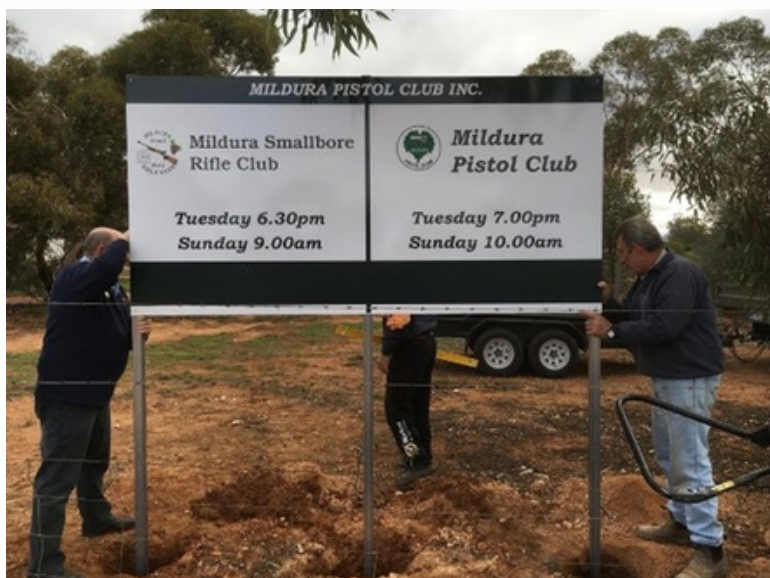
The Mildura sign goes up