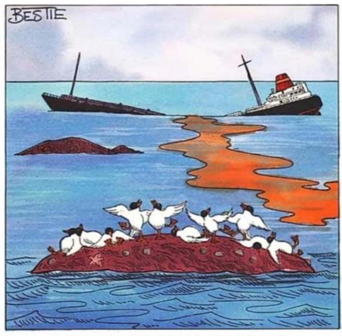
AFTER 50,000 CALLONS OF WHISKY LEAKED INTO THE SEA, NO TERN WAS LEFT UNSTONED